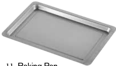
11. Baking Pan