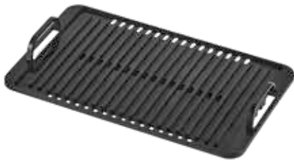
9. Grill Plate