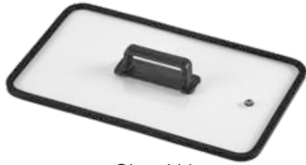
7. Glass Lid