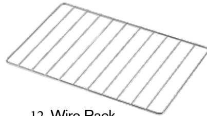
12. Wire Rack