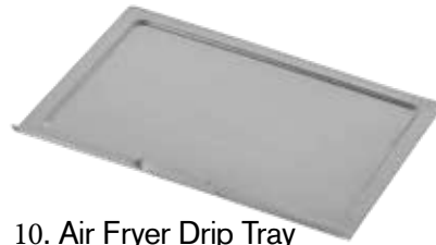
10. Air Fryer Drip Tray