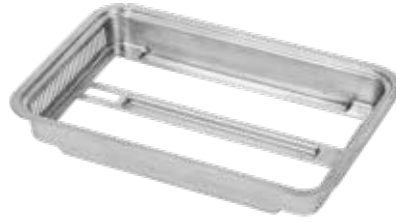
8. Grill Drip Tray