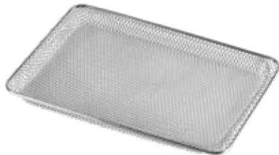
13. Crisper Tray