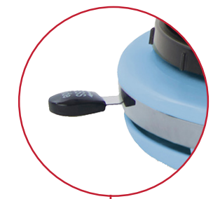
Bowl Shift Level

• Accessory type and quantity may vary depending on the model.