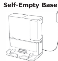
Holds dirt and debris. Capacity ranges based on model.