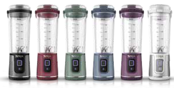
The images shown here are for illustrative purposes only and may be subject to change.