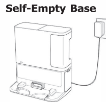
Holds dirt and debris. Capacity ranges based on model.