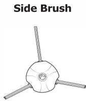
Moves debris into robot's path.